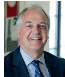
PAUL POLMAN CEO AND BOARD MEMBER UNILEVER N.V.

“Boards should support organisations in making a difference, both in financial terms and in infusing a sense of purpose and broader societal responsibility.”