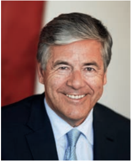
DR. JOSEF ACKERMANN CHAIRMAN BANK OF CYPRUS HOLDINGS PLC.

Our Advisory Board members have a strong commitment to advancing boardroom leadership and effectiveness. All members will actively contribute to the St.Gallen Board Retreat in June 2018.